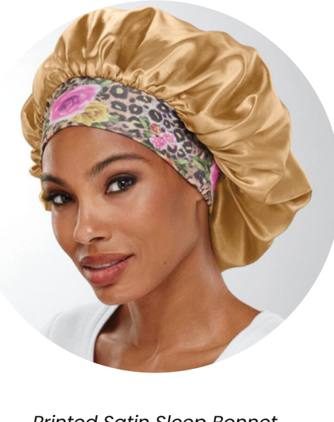
Printed Satin Sleep Bonnet by Especially Yours®