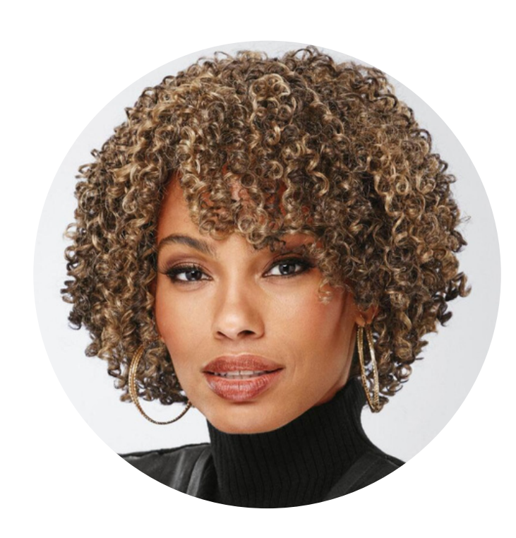
Anita Wig by Especially Yours®