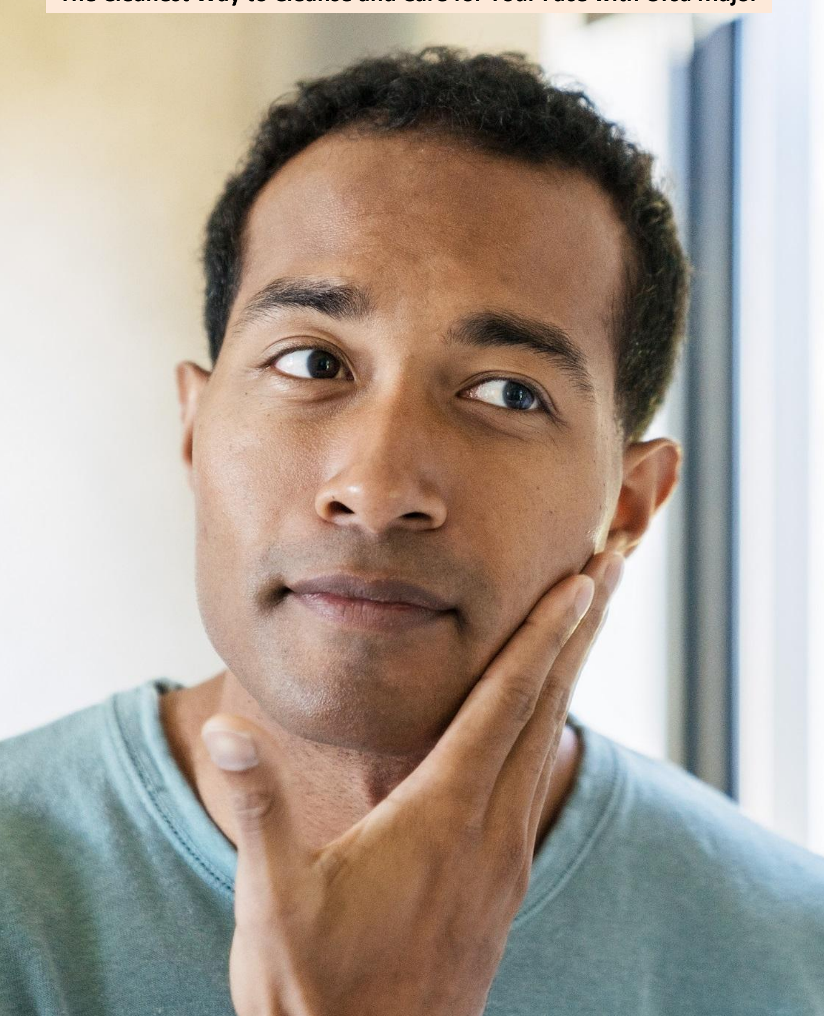
The Cleanest Way to Cleanse and Care for Your Face with Ursa Major