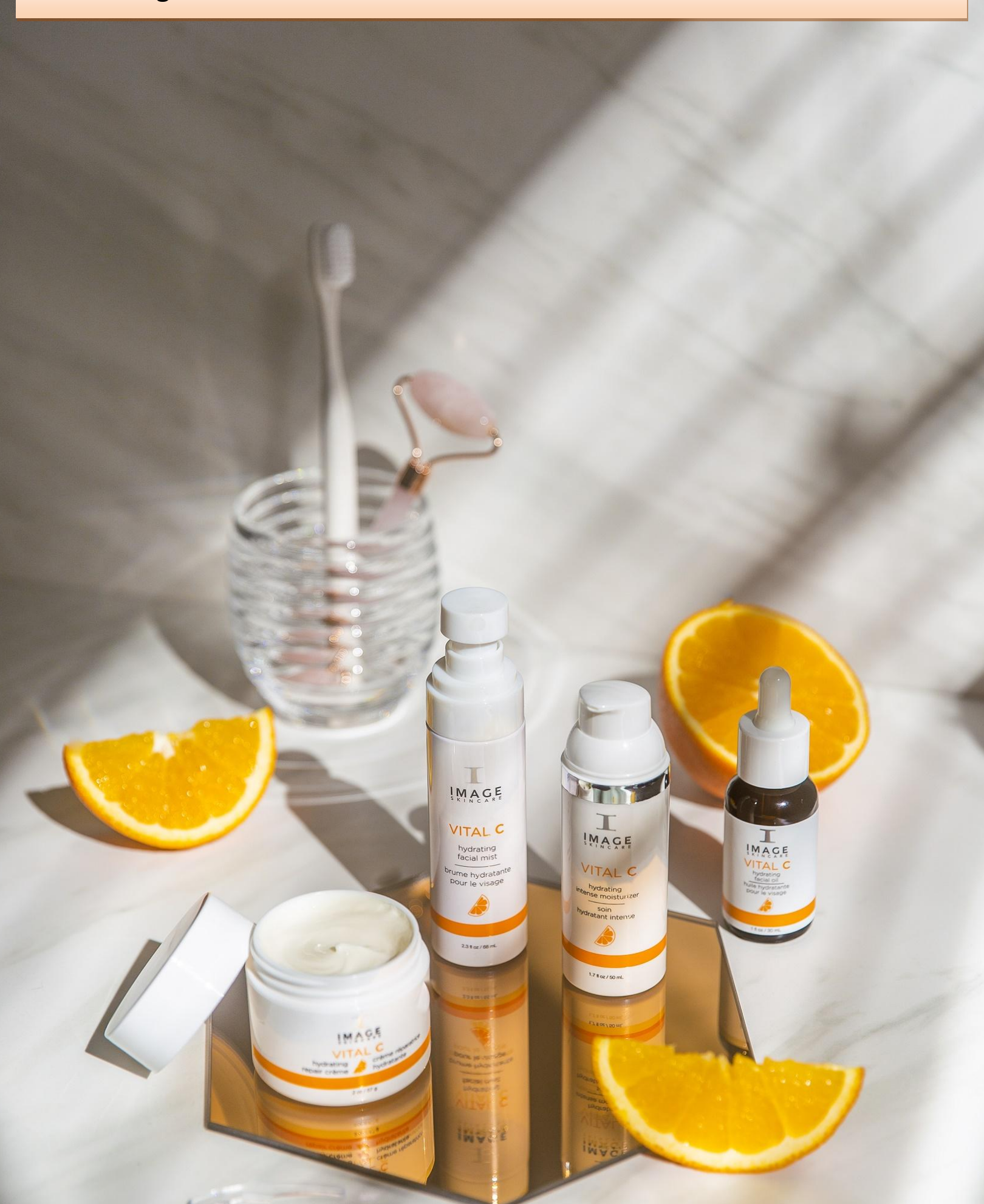
The Healing Touch: 5 Benefits of an IMAGE Skincare® Facial at Hand & Stone