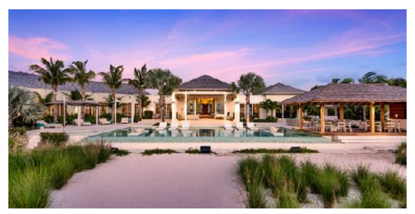
Related Best Time To Visit Turks and Caicos